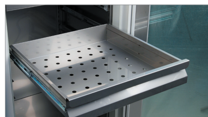
Drawer shelves (slide type)