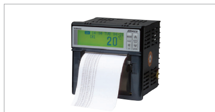
Thermal line recorder