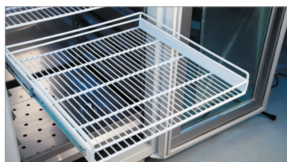
Wire shelves (slide type)